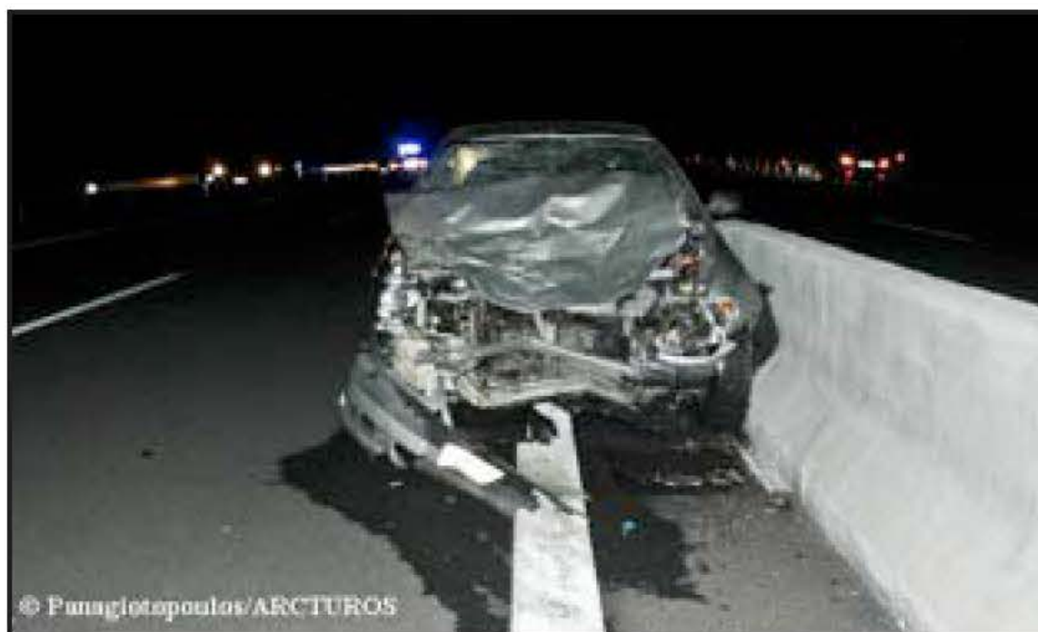
A car severely damaged after a collision with a bear on the “Egnatia” highway in Greece

In order to increase the understanding of the activity patterns and structure of the local brown bear population, the Greek NGO ARCTUROS with the financial assistance of VODAFONE Hellas, have been implementing since the beginning of 2010 a monitoring program, that includes satellite tracking and non-invasive genetic monitoring of bears. In addition, and in order to highlight the importance of this issue to the general public in Greece and the international scientific community, ARCTUROS in cooperation with the University of Western Macedonia will be hosting the 2011 annual meeting of the European Infra Eco Network, a network of experts dealing with the impact of infrastructure on wildlife. The conference will take place on 21-24 September 2011 at the city of Kastoria and the traditional village of Nymfeo in northwestern Greece and will focus on the impact of highways on large carnivores and explore ways to mitigate them. Participants will have the opportunity to meet experts from around the continent, as well as to visit important conflict areas and get informed about the efforts of Egnatia S.A., the Greek state, ARCTUROS and other environmental NGOs to deal with this issue. Conference details will be posted soon on the ARCTUROS website ( www.arcturos.gr ). 🐻